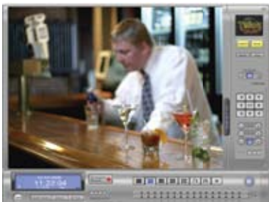
Simulated image without POS Integration