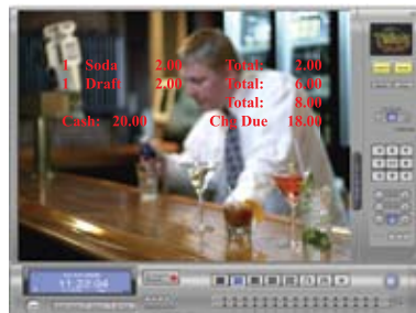
Simulated image with POS Integration & Overlay