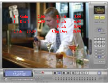
Simulated image with POS Integration & Overlay